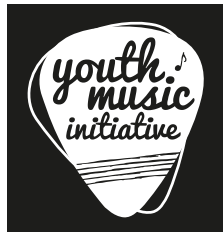
White on a black or dark coloured background