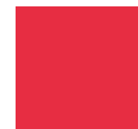
Red PMS 1787 C=0 M=82 Y=53 K=0 R=244 G=54 B=76