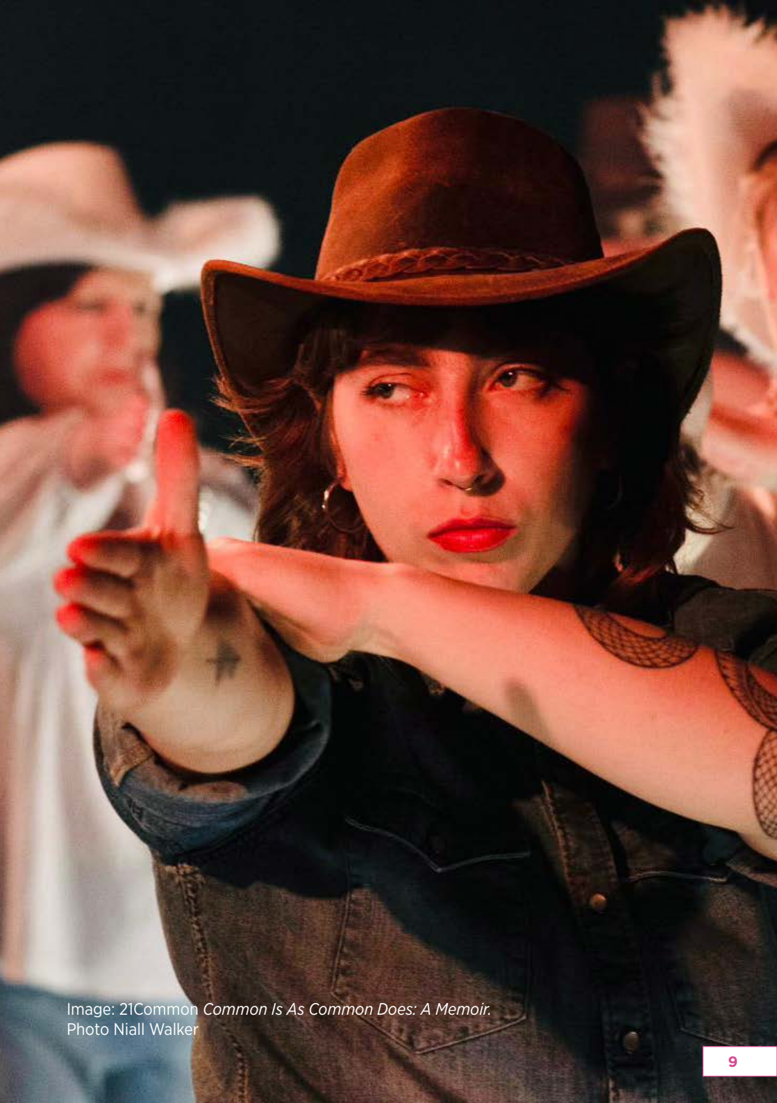
Image: 21Common Common Is As Common Does: A Memoir .