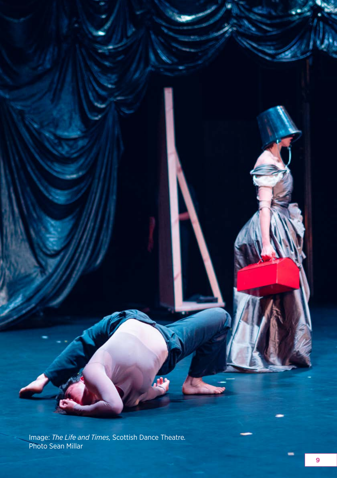
Image: The Life and Times , Scottish Dance Theatre.