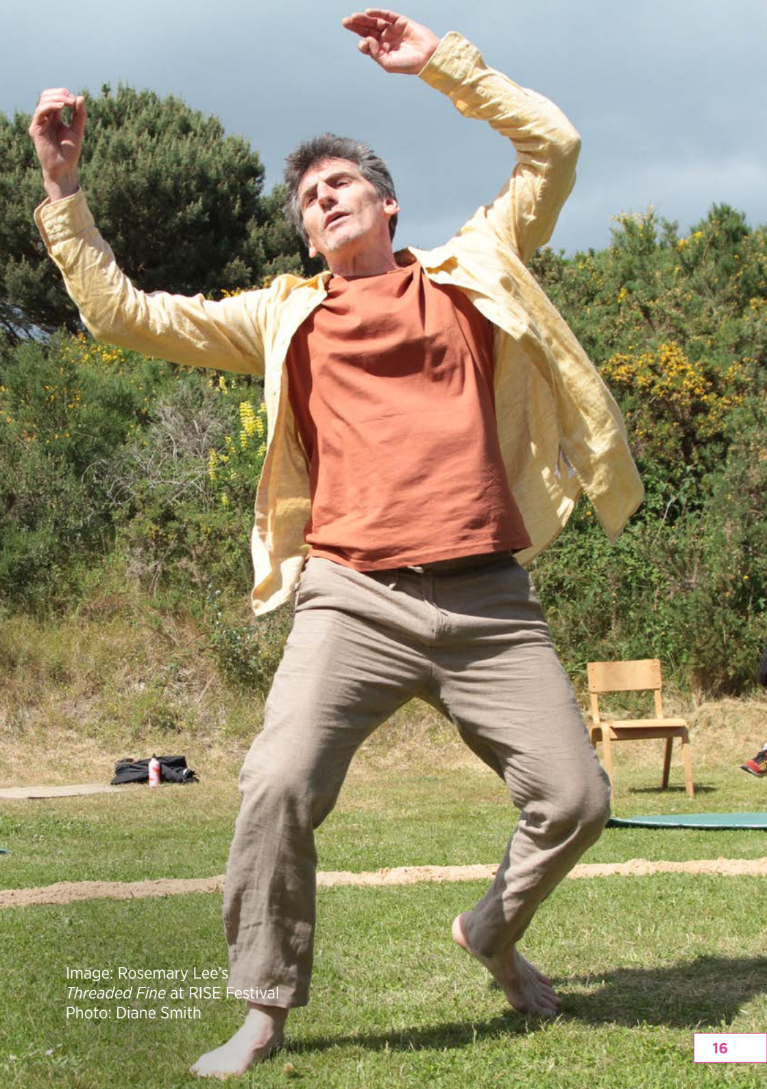
Image: Rosemary Lee's Threaded Fine at RISE Festival