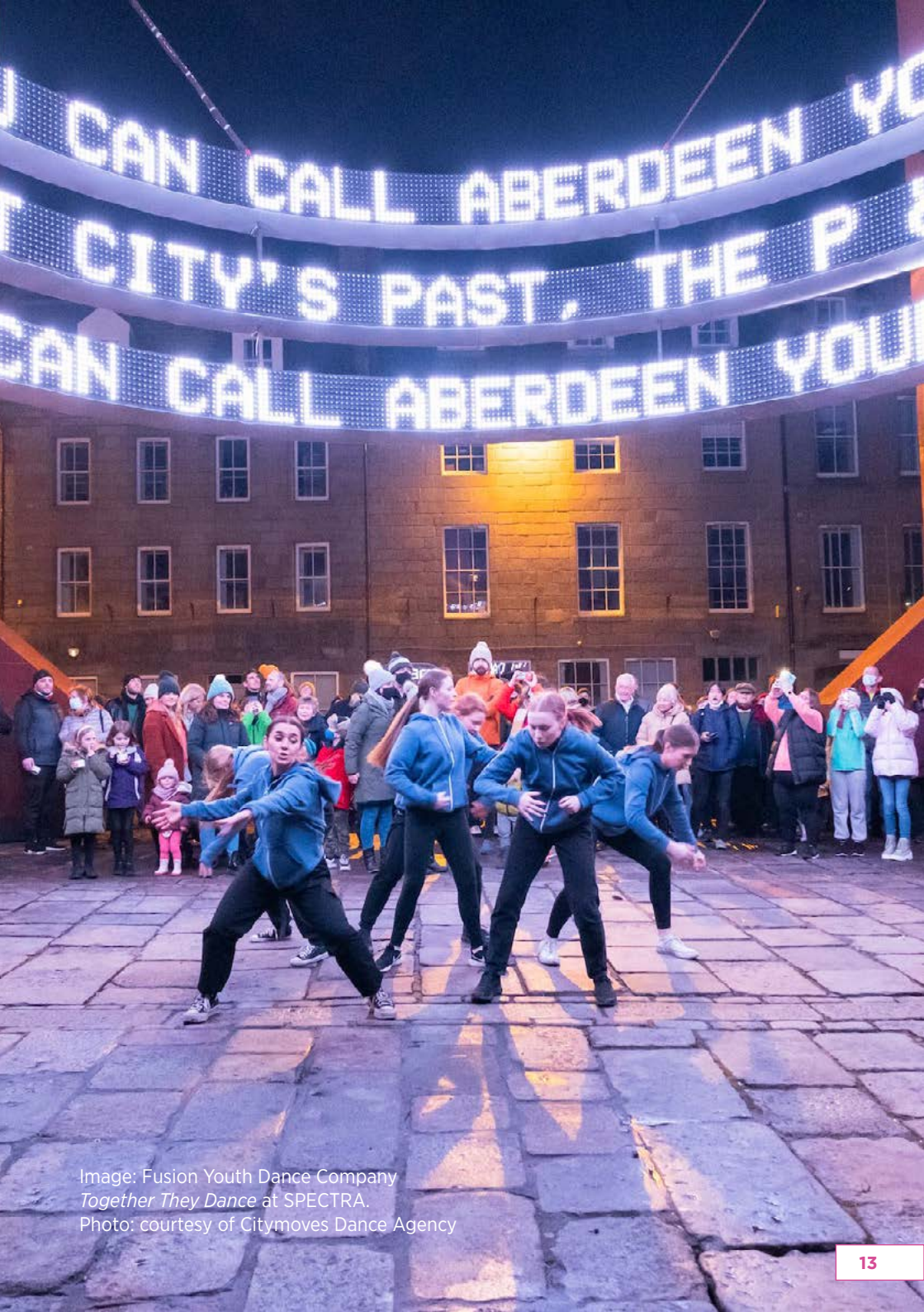
Image: Fusion Youth Dance Company Together They Dance at SPECTRA.